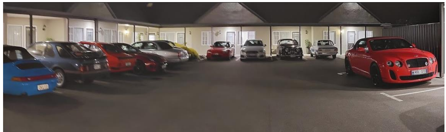
Parked up for the night in Greymouth